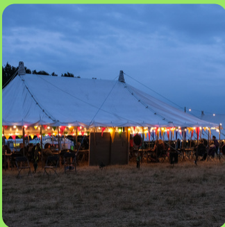
WFF x your business video for Social Media