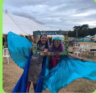
Build a dedicated Social Media package