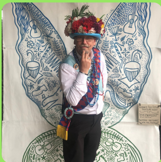
Sponsor awards or prizes