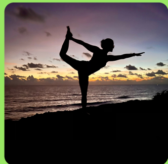
Sponsor a wellbeing initiative