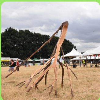
Sponsor a green initiative on site