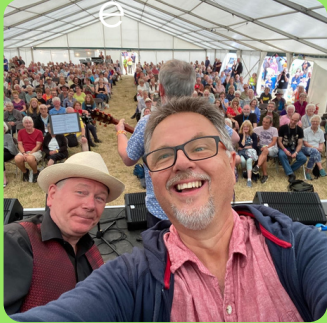
Guest MC spot on stage