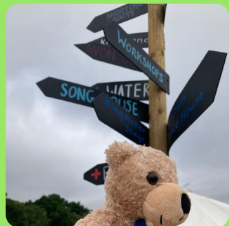
Your name on it... (name it!)