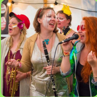
Social Media takeover