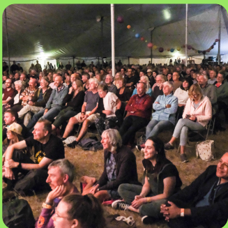
Sponsor a main site stage